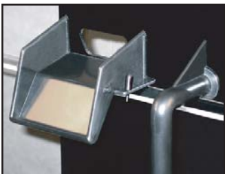
Inlet & Outlet