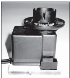
Replacement skimmer pumps available CPR code: AEROF1RP