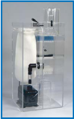
With carbon pad & two types of filter pad*

Introducing the latest in modular filtration technology. The Marine Tower can be easily used to create a Berlin or refugium set up, and brings together protein skimming, mechanical and chemical filtration into one unit. The unit has an in-sump design with three separate sections to help create customized filtration systems and to utilize several types of filter media.