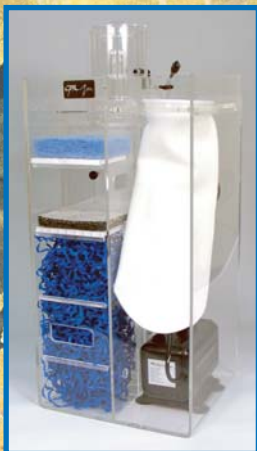
With filter pad, carbon pad & bio-media*

*Optional media used to demonstrate media chamber options