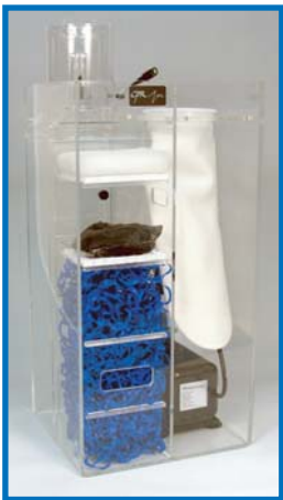
With filter pad one bag media, & bio-media*

Modular Application- Use your own sump to create a Berlin or refugium set up